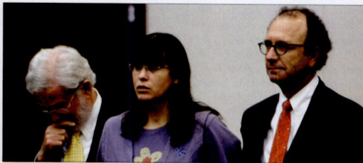
Yates received her not guilty verdict in July this year